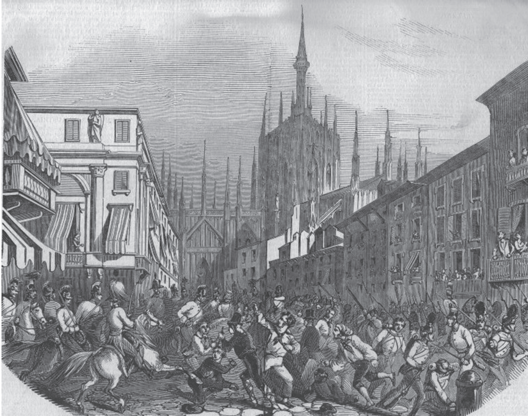
A drawing from the time of the uprising in Milan in March 1848.