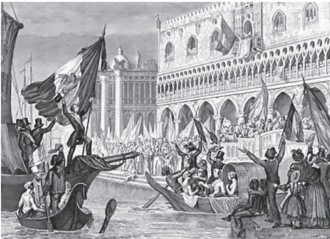
A drawing from the time of Daniele Manin proclaiming the Republic of Venice in 1848.