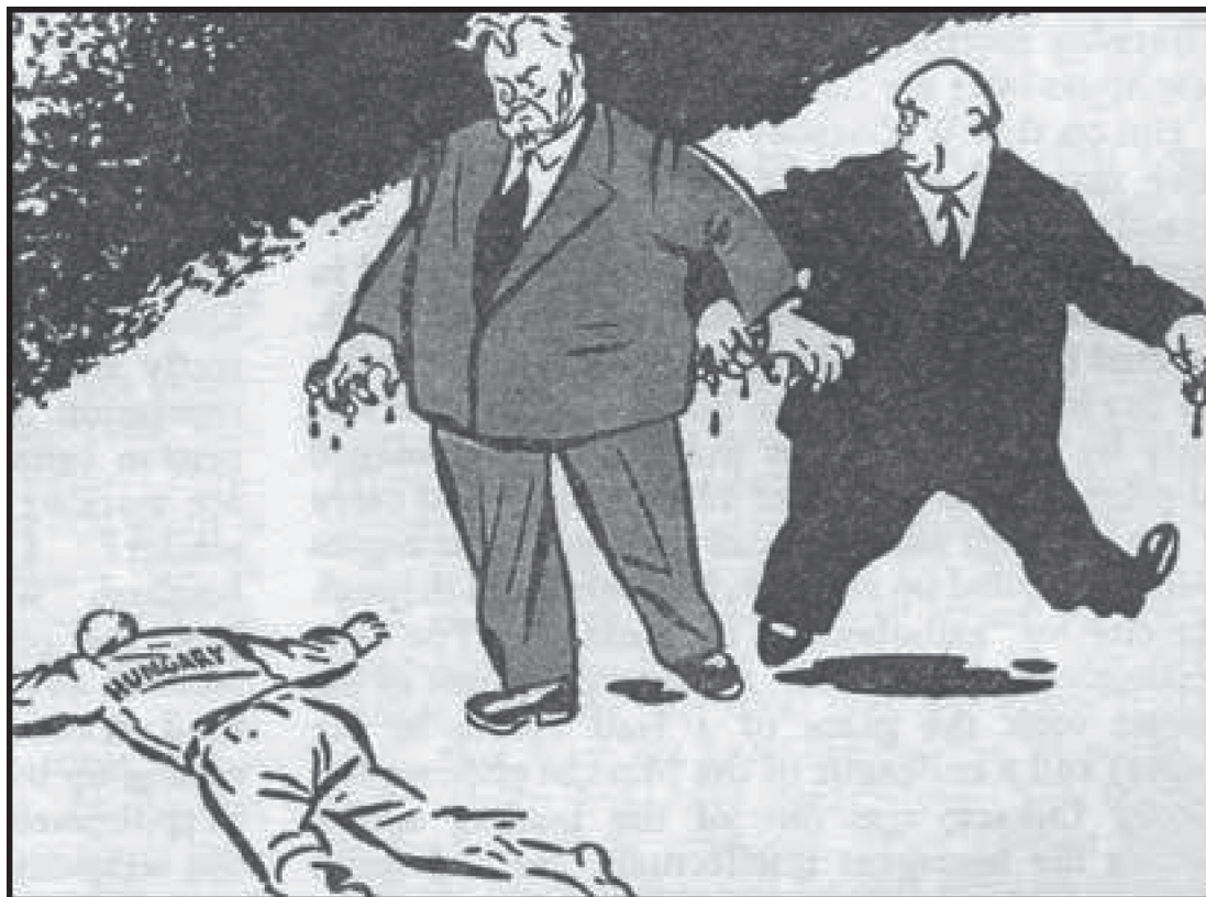
A cartoon published in an Indian newspaper, November 1956. Khrushchev is saying to a colleague, 'Let's go wash our hands in the Canal.'