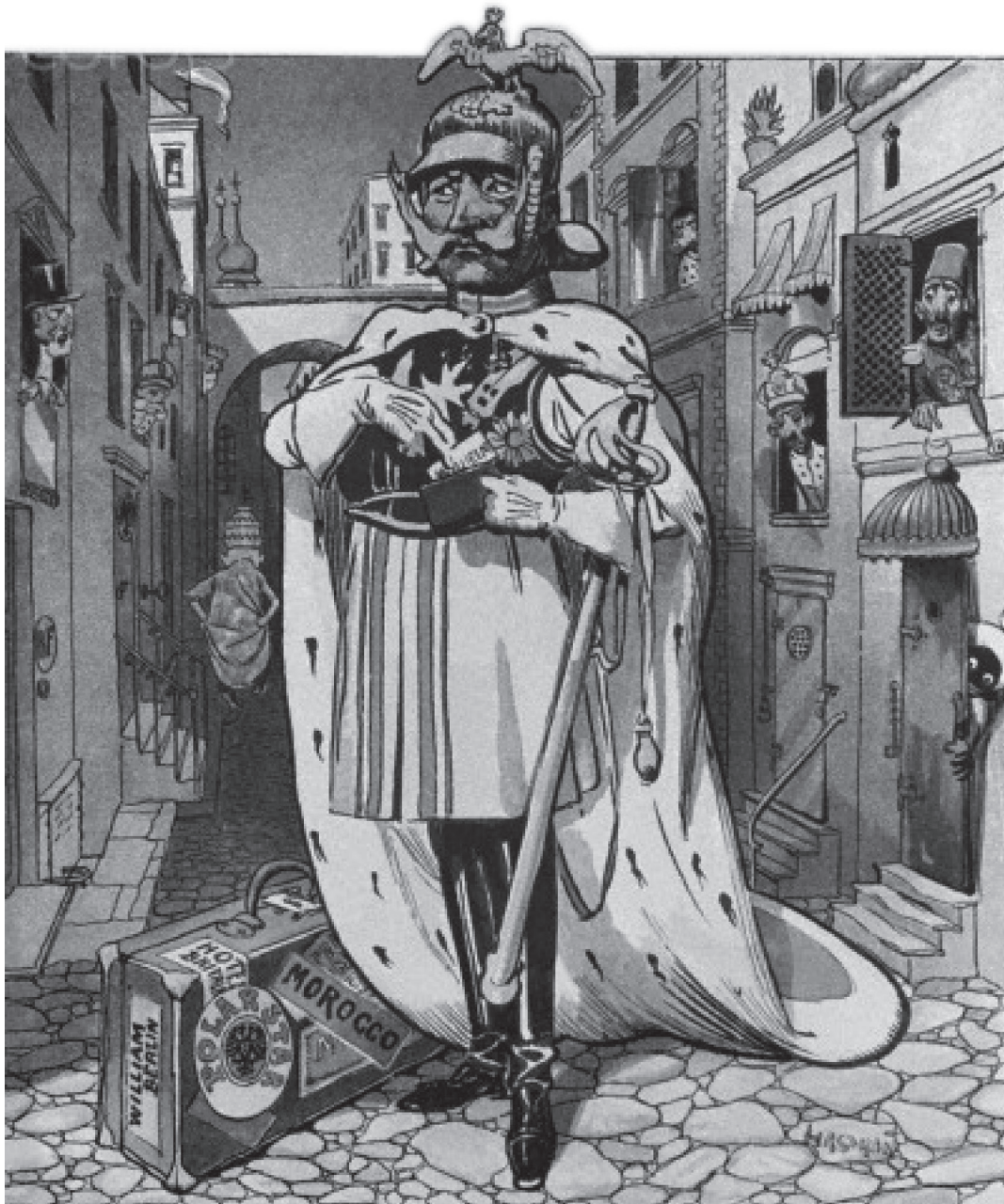
A British cartoon published in 1905. The caption to this cartoon read 'The Morocco Crisis: Let men see - whom shall I call on next?'