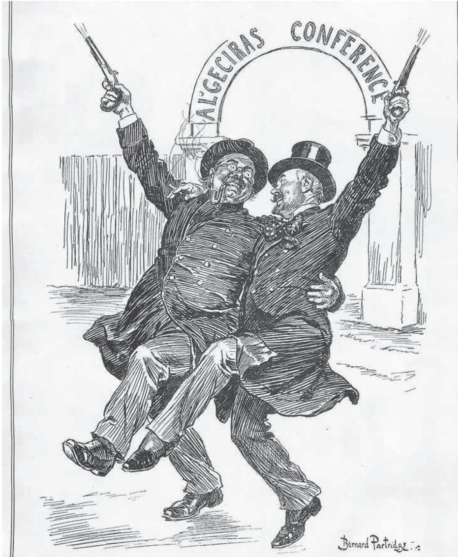
A British cartoon entitled 'Shots of Joy', published in April 1906. The caption to the cartoon read 'The Algeciras Conference has practically been concluded to the mutual satisfaction of the two rival powers whose differences at one time threatened to end in something worse than a diplomatic duel.'