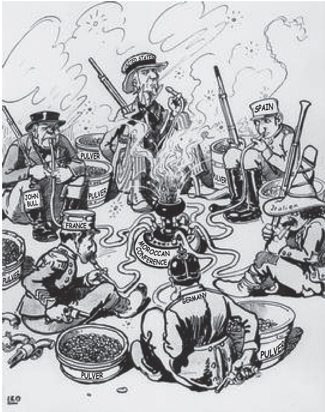
A German cartoon published in February 1906. The caption to the cartoon read 'At the Moroccan Conference: enthusiasm for smoking the peace pipe does not exclude the danger of a general explosion.' Pulver means gunpowder.