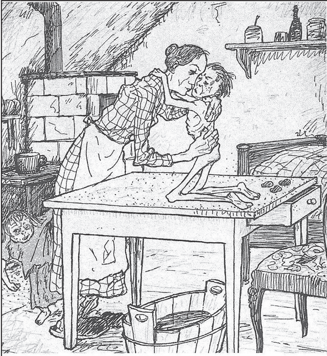
A cartoon entitled 'Consolation' published in a German magazine, 24 June 1919. The mother is saying to her child, 'When we have paid 100,000,000,000 marks, then I shall be able to give you something to eat.'