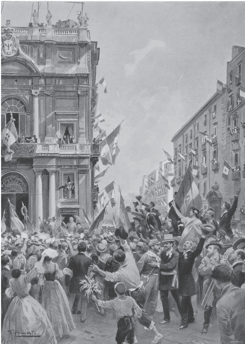
An Italian drawing from 1910 of Garibaldi announcing from a balcony in Naples the annexation of the Kingdom of the Two Sicilies to Italy in September 1860.