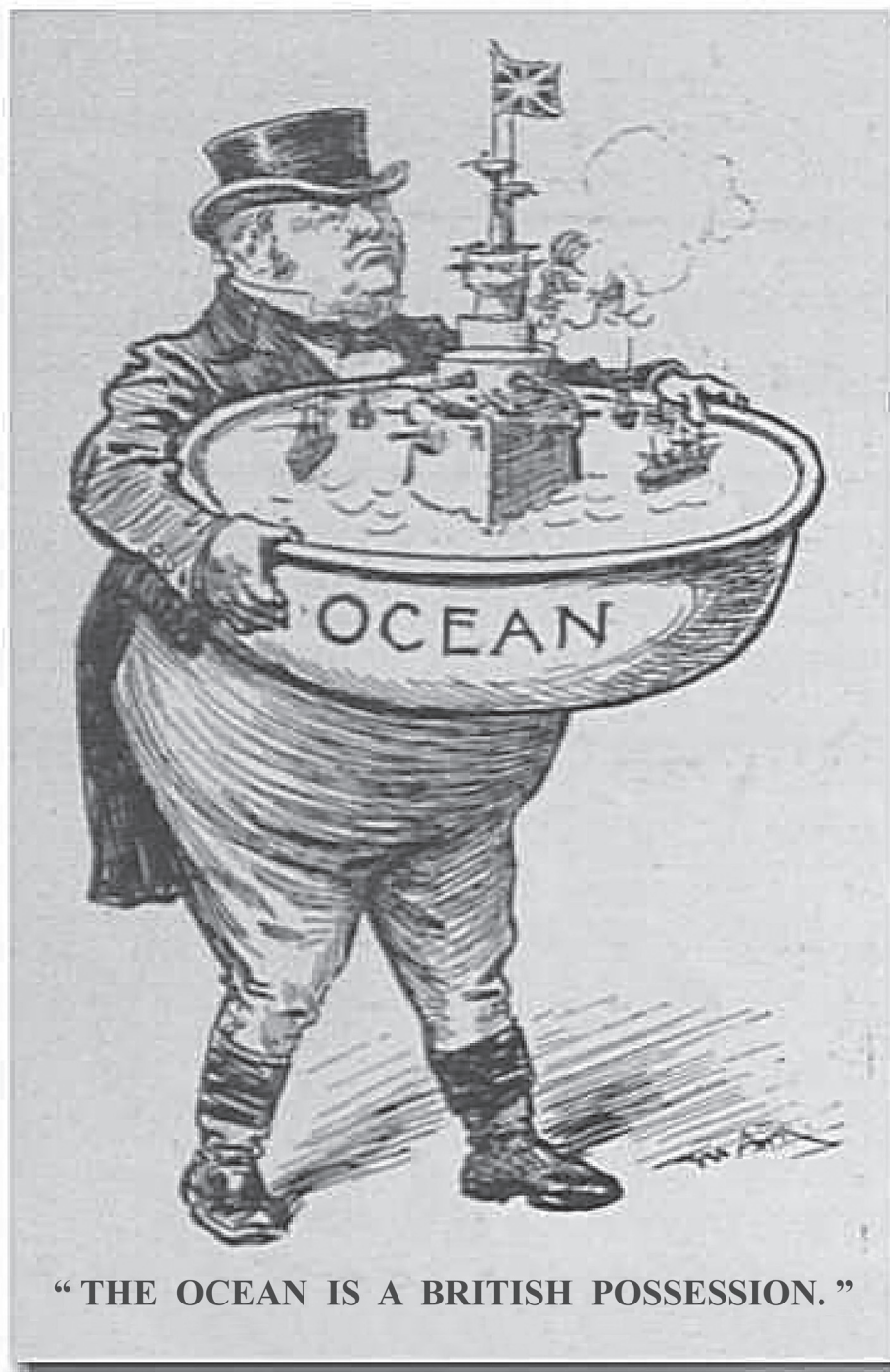
A cartoon published in an American magazine, January 1900.