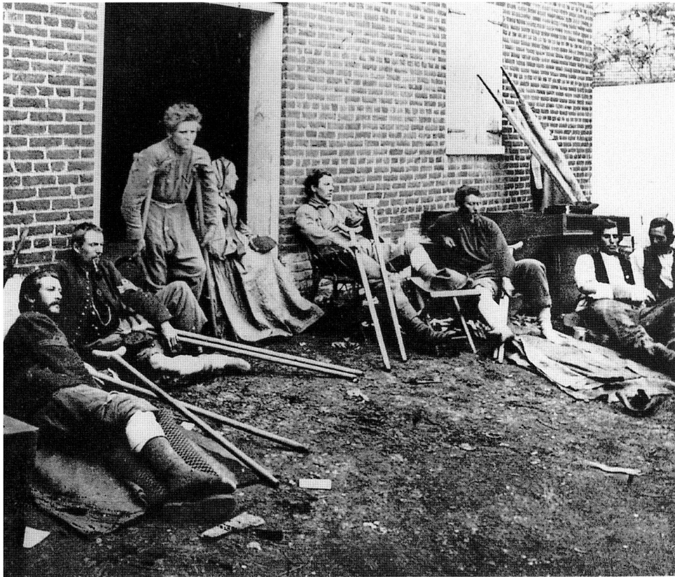
A photograph of Union soldiers wounded at the Battle of Fredericksburg, December 1862. The photograph was actually taken in May 1863.