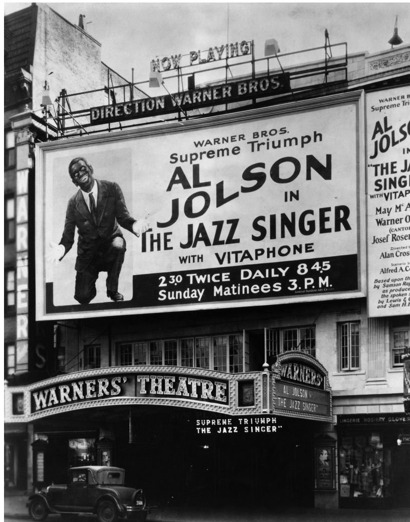
A huge billboard advertising the film, 'The Jazz Singer', outside a cinema in New York City, 1927.