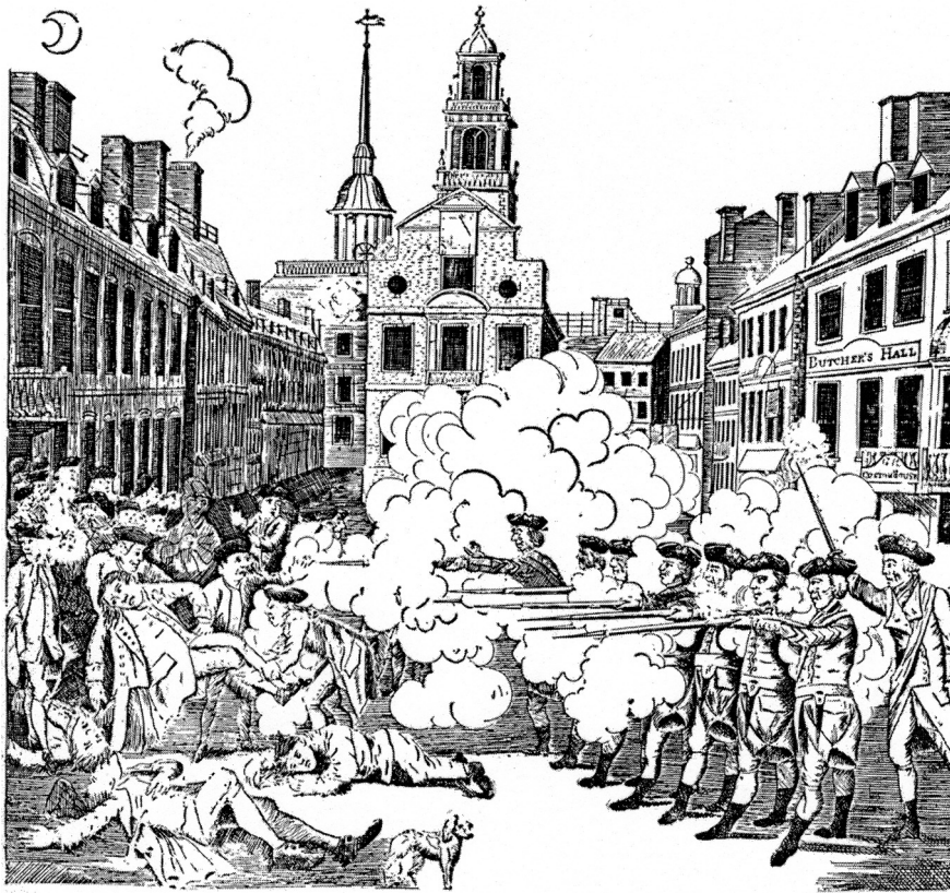
An American engraving, 'The Boston Massacre', produced by Paul Revere in 1770. The engraving was circulated widely and became a generally accepted interpretation of the event.