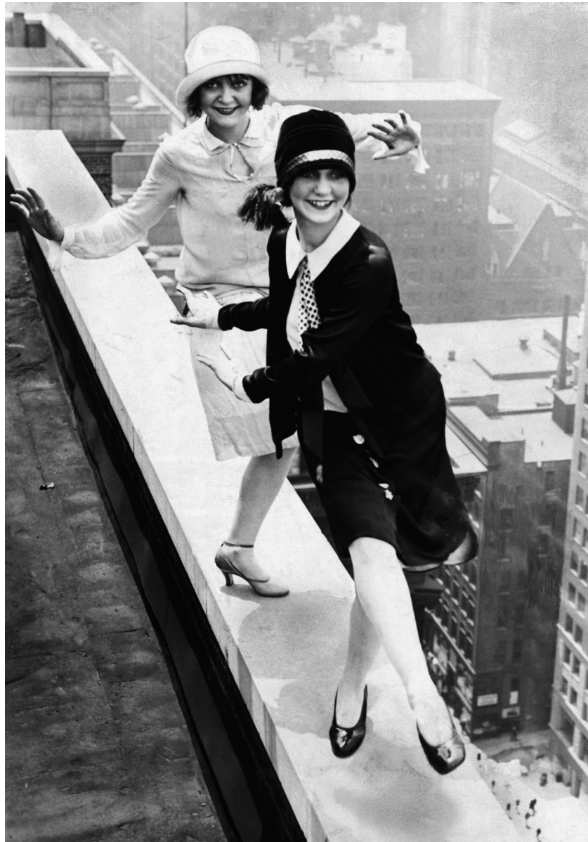
A photograph of two 'flappers' dancing on the roof of the Sherman Hotel, Chicago, 1926.