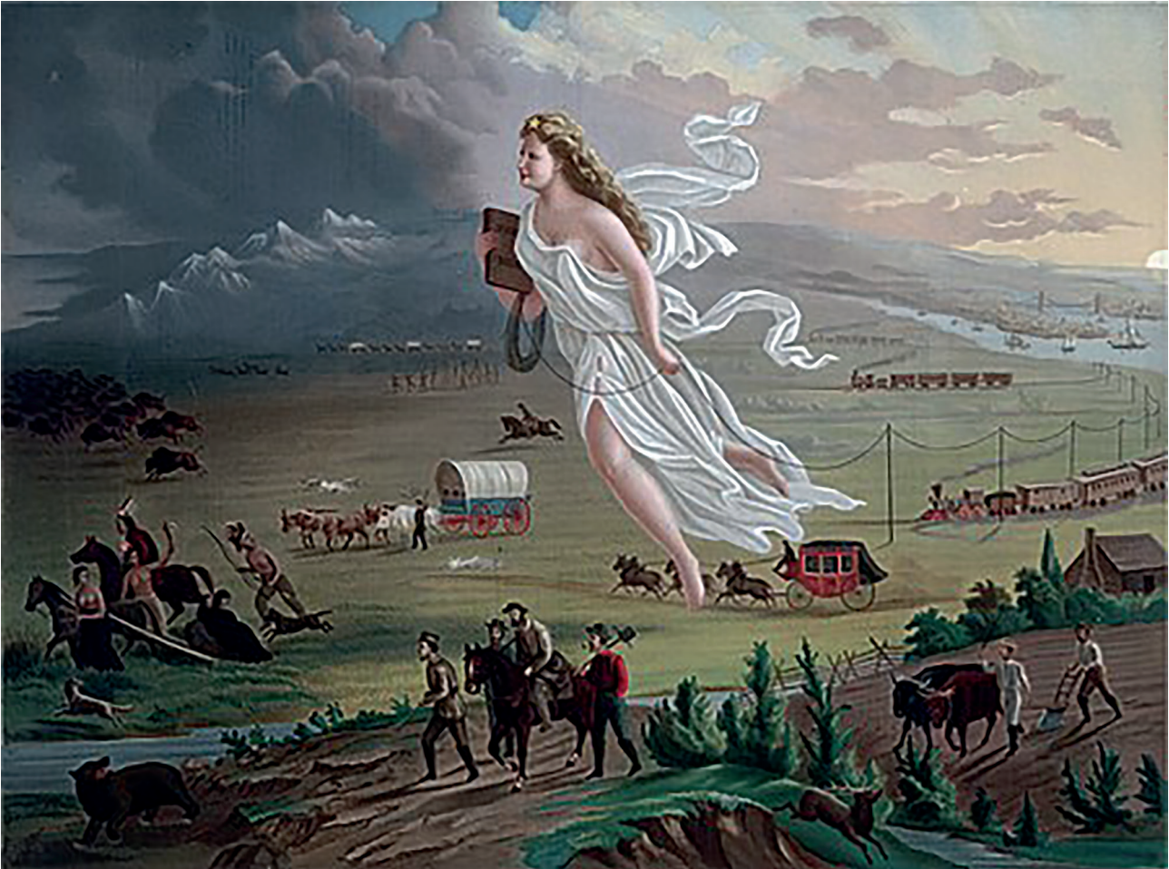
A painting called American Progress , showing the idea of Manifest Destiny, 1872.