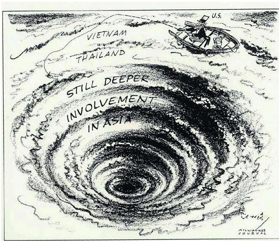
A cartoon published in an American newspaper in 1965.