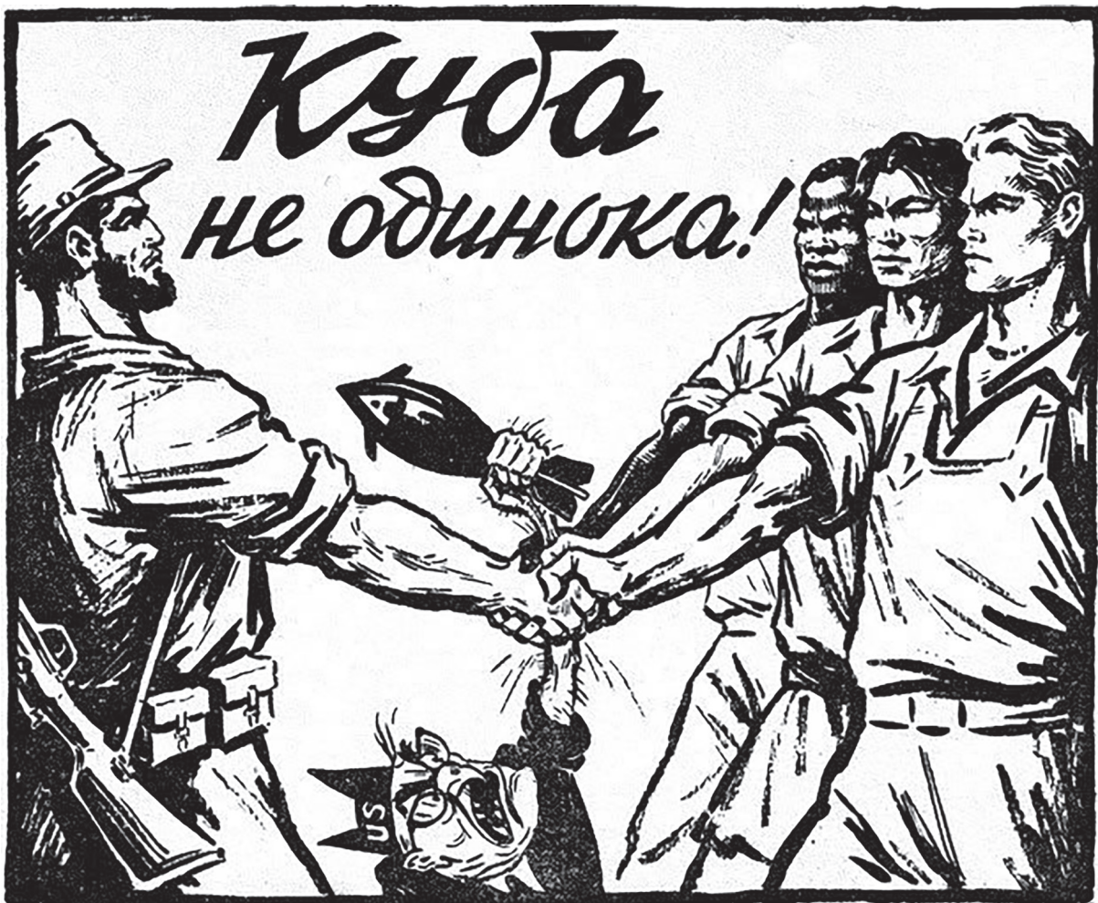
A cartoon published in a Soviet newspaper, 14 October 1962. The caption reads 'Cuba is not alone.'