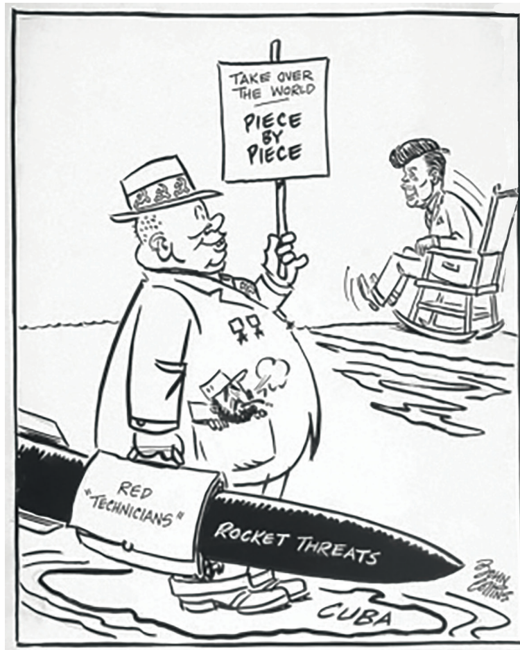
A Canadian cartoon published in October 1962.