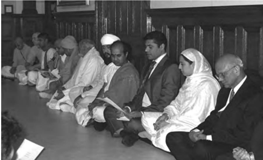
Members of different faiths meet to pray and talk about how they can work together to help victims of the tsunami disaster.