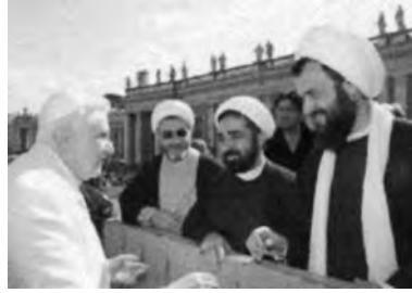
The Pope meets with Muslim leaders to encourage a better understanding between Christianity and Islam.