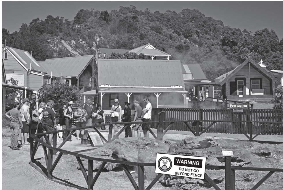
A group of tourists viewing a geothermal vent as part of a guided tour.