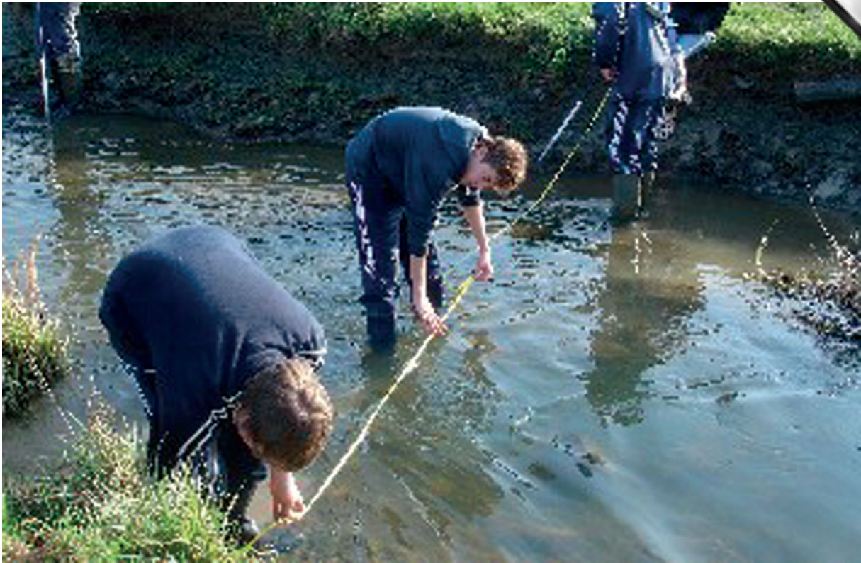
Photograph B for Question 1