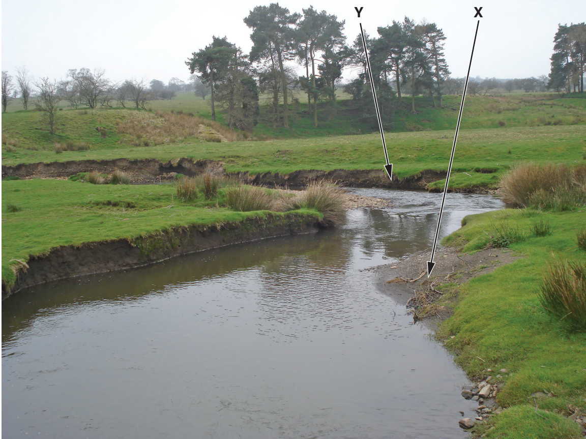
Fig. 4.1 for Question 4