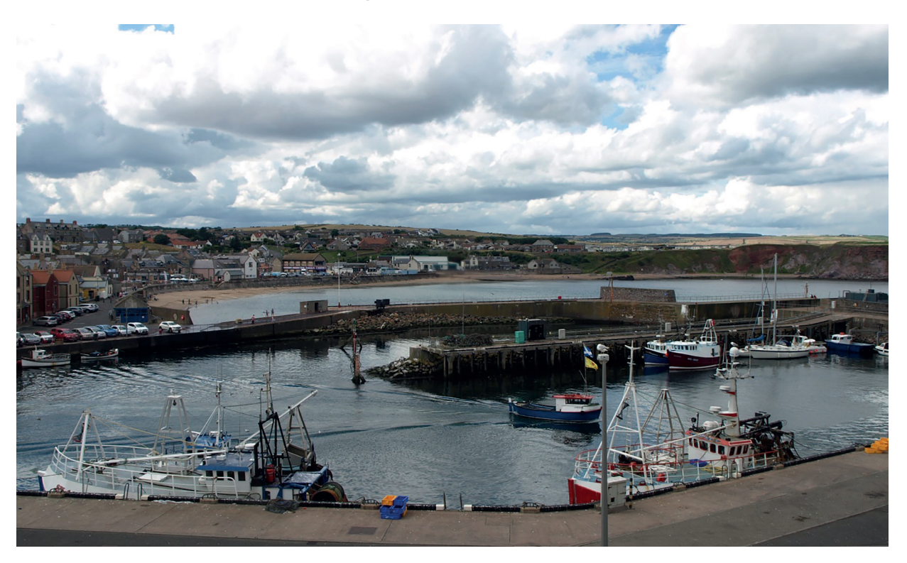
Fig. 4.1 for Question 4