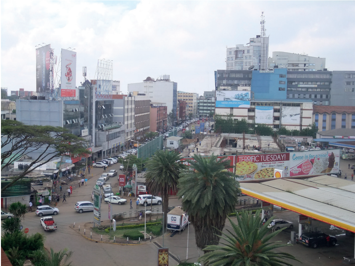
Fig. 3.1 for Question 3