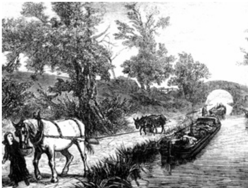
An early nineteenth-century drawing of canal barges.

22 Study the picture, and then answer the questions which follow.