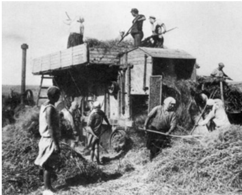
Threshing on a collective farm.

12 Study the photograph, and then answer the questions which follow.