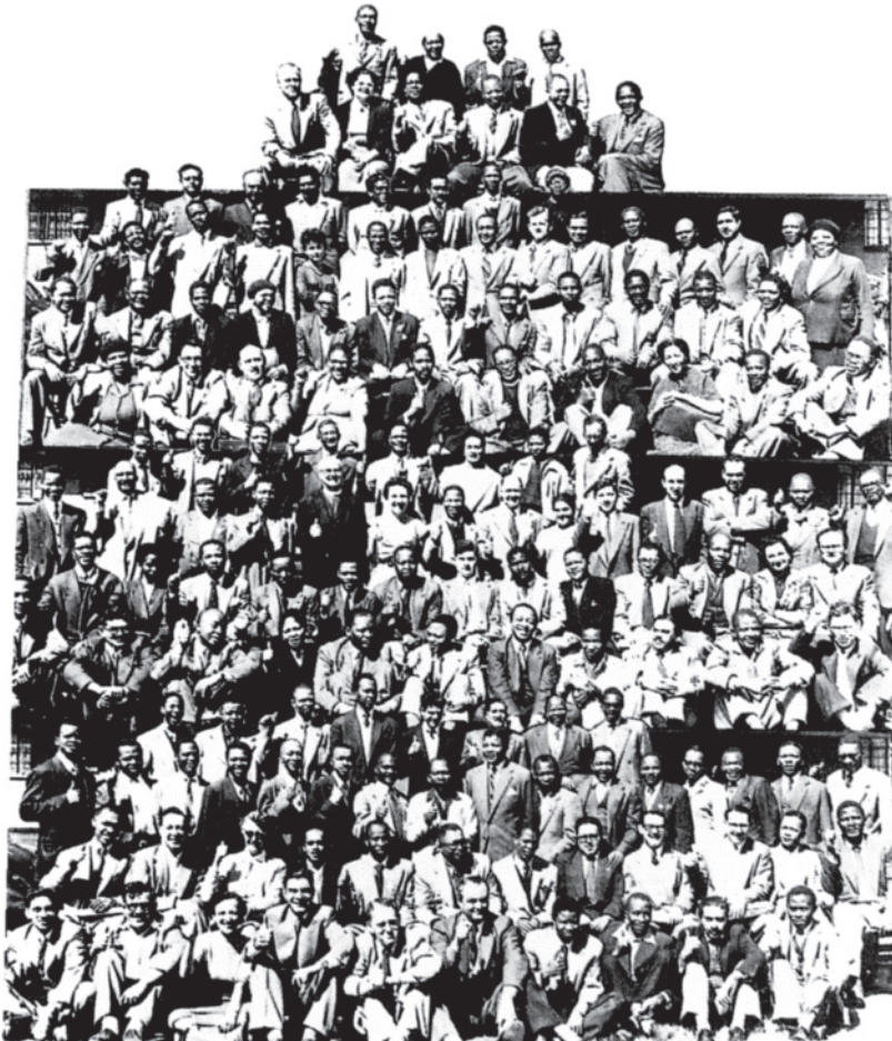
The accused at the start of the Treason Trials, December 1956.

18 Study the photograph, and then answer the questions which follow.