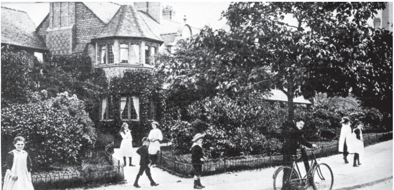
Workers' cottages built by Lever in the model village of Port Sunlight.

23 Study the photograph, and then answer the questions which follow.