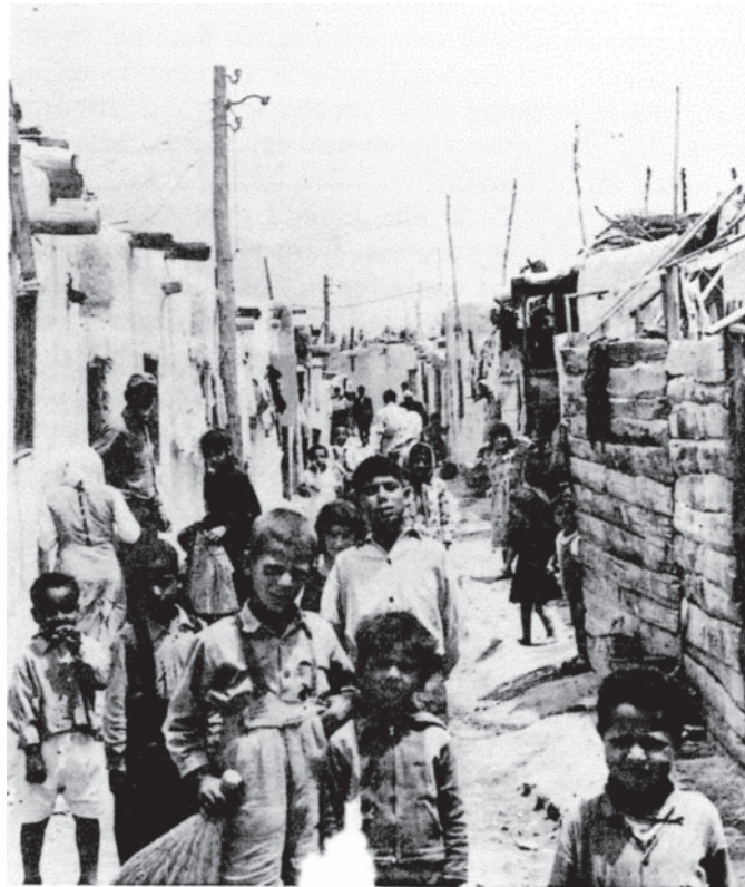
A street in a Palestinian refugee camp in 1966.

21 Study the photograph, and then answer the questions which follow.