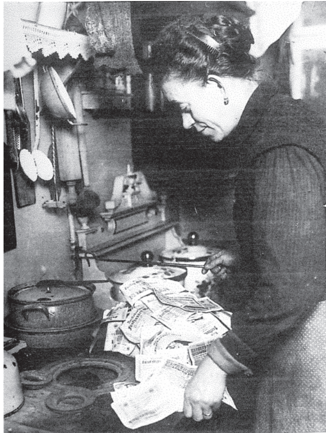
A woman using banknotes to start her fire in 1923.