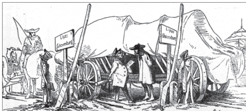
A German cartoon showing the collection of customs duties in 1834.