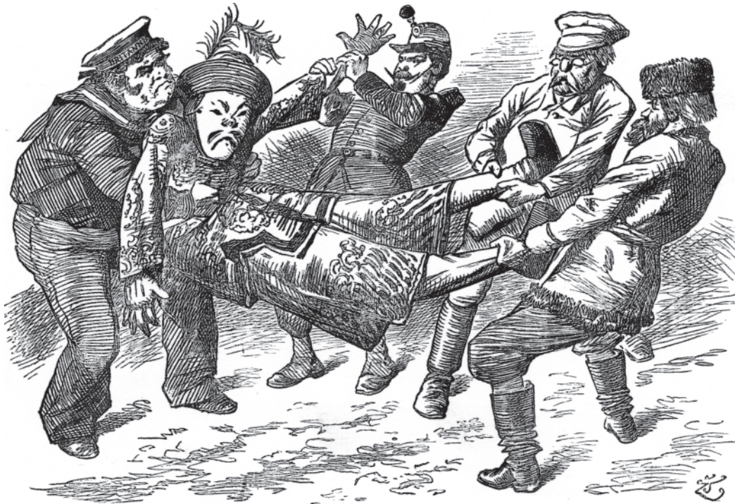
A cartoon showing foreign countries competing over China.

24 Study the cartoon, and then answer the questions which follow.