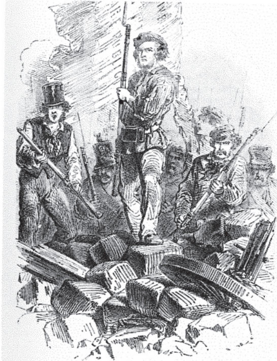
Paris during the 'June Days', 1848.