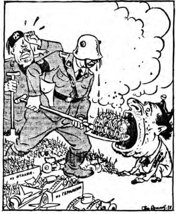
— Ч-чорт!.. Его аппетит растет обратно пропорционально его успехам...

A Soviet cartoon published in 1938. The cartoon is called 'Greedy dependant'. The figures on the left, who are feeding Franco, are Mussolini and Hitler. The boxes are labelled 'From Italy' and 'From Germany'. Mussolini is saying 'Devil! His appetite grows as his success becomes less.'