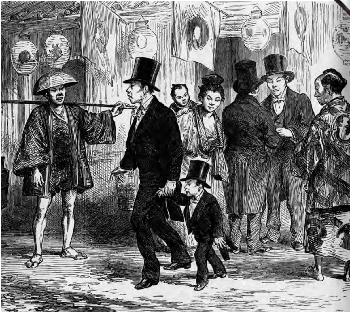
A cartoon of a street scene in Japan towards the end of the nineteenth century. It was published in a British magazine at the time.