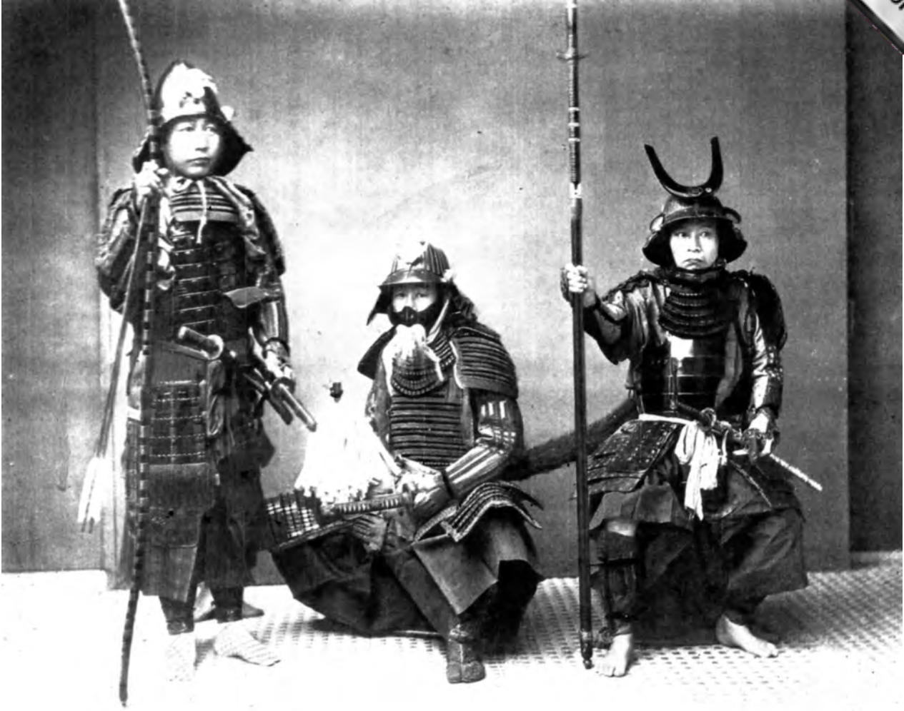
A photograph of Samurai in the 1890s.