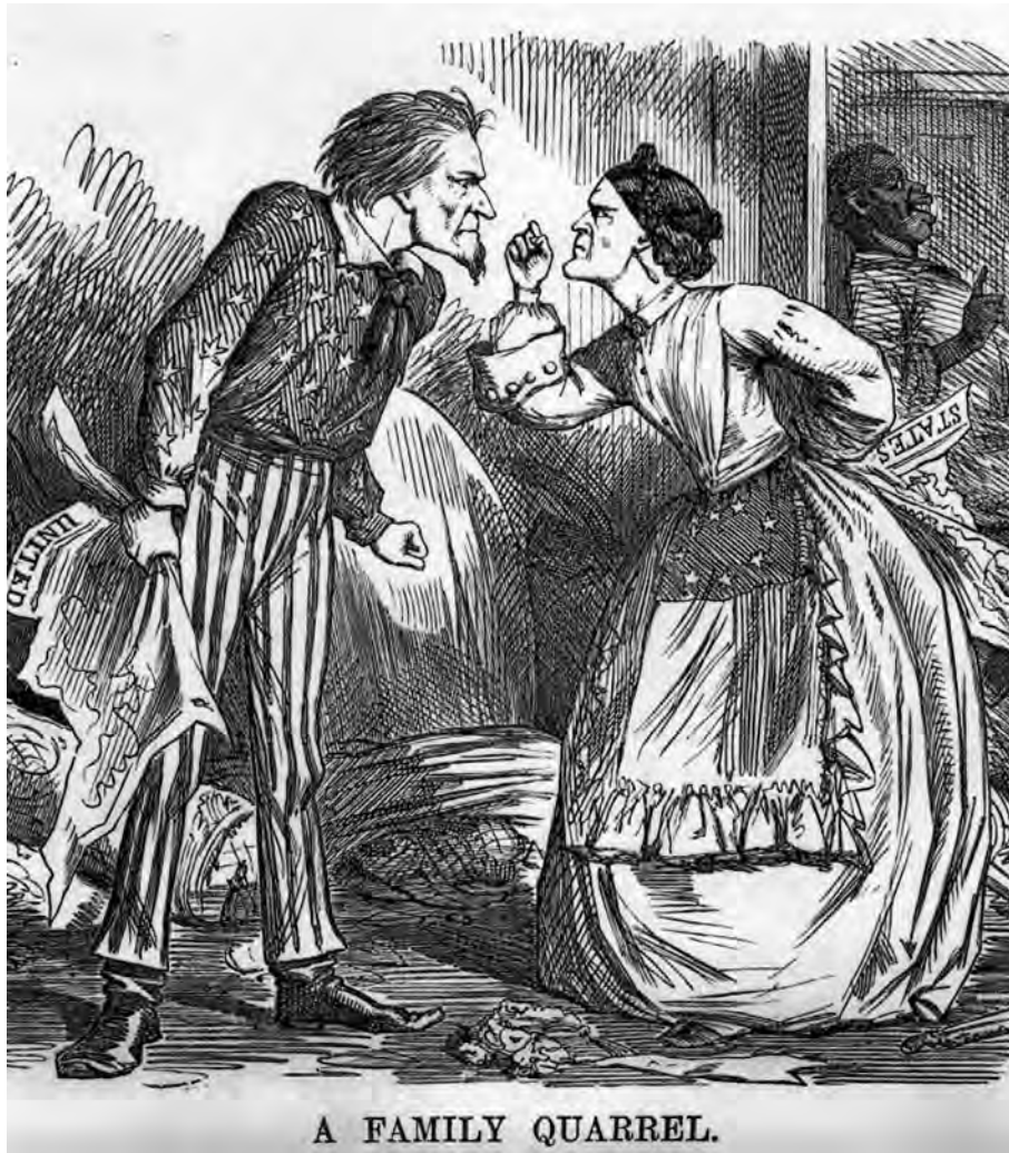
A British cartoon published in September 1861.