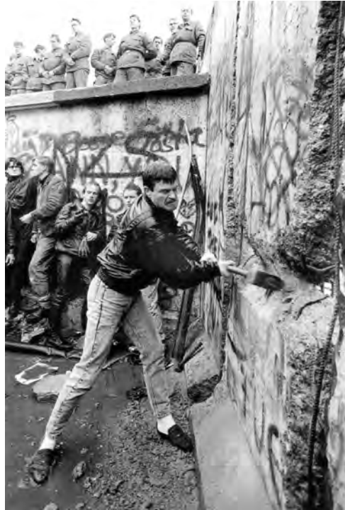
A photograph of events at the Berlin Wall in November 1989.