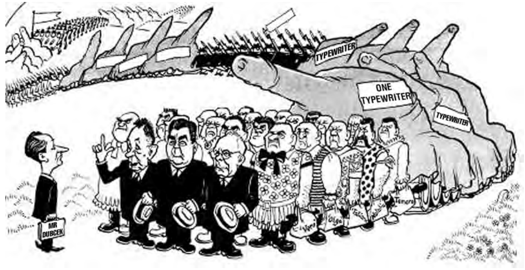
A British cartoon published on 24 July 1968. The leading figures facing Dubcek are Kosygin and Brezhnev. They are saying to Dubcek 'Of course, Mr Dubcek, we've had to bring a few lady secretaries and some tea boys.'