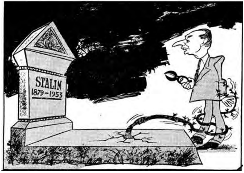
A British cartoon published on 23 July 1968. The figure on the right is Dubcek.