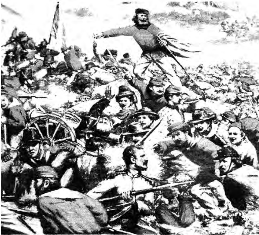
An illustration of Garibaldi in the battle of Calatafimi, published shortly after the battle in 1860.