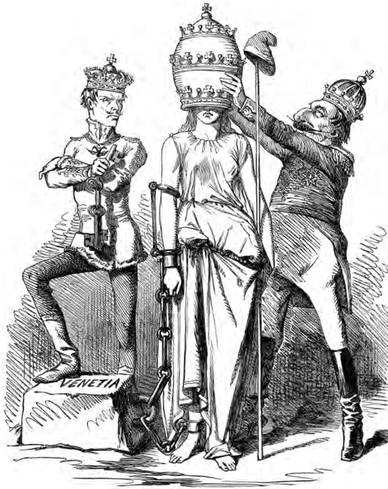
FREE ITALY (P)

A British cartoon published in July 1859. The three figures represent (from left to right) Austria, Italy and Napoleon III. Napoleon is placing the Papal crown on Italy's head.