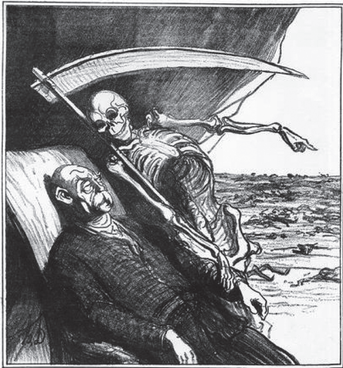
A cartoon published in France in August 1870 showing the war dead. The title of the cartoon is 'News'. The caption under the cartoon said, 'Bismarck's nightmare.' The Grim Reaper is saying, 'Thank you!...'