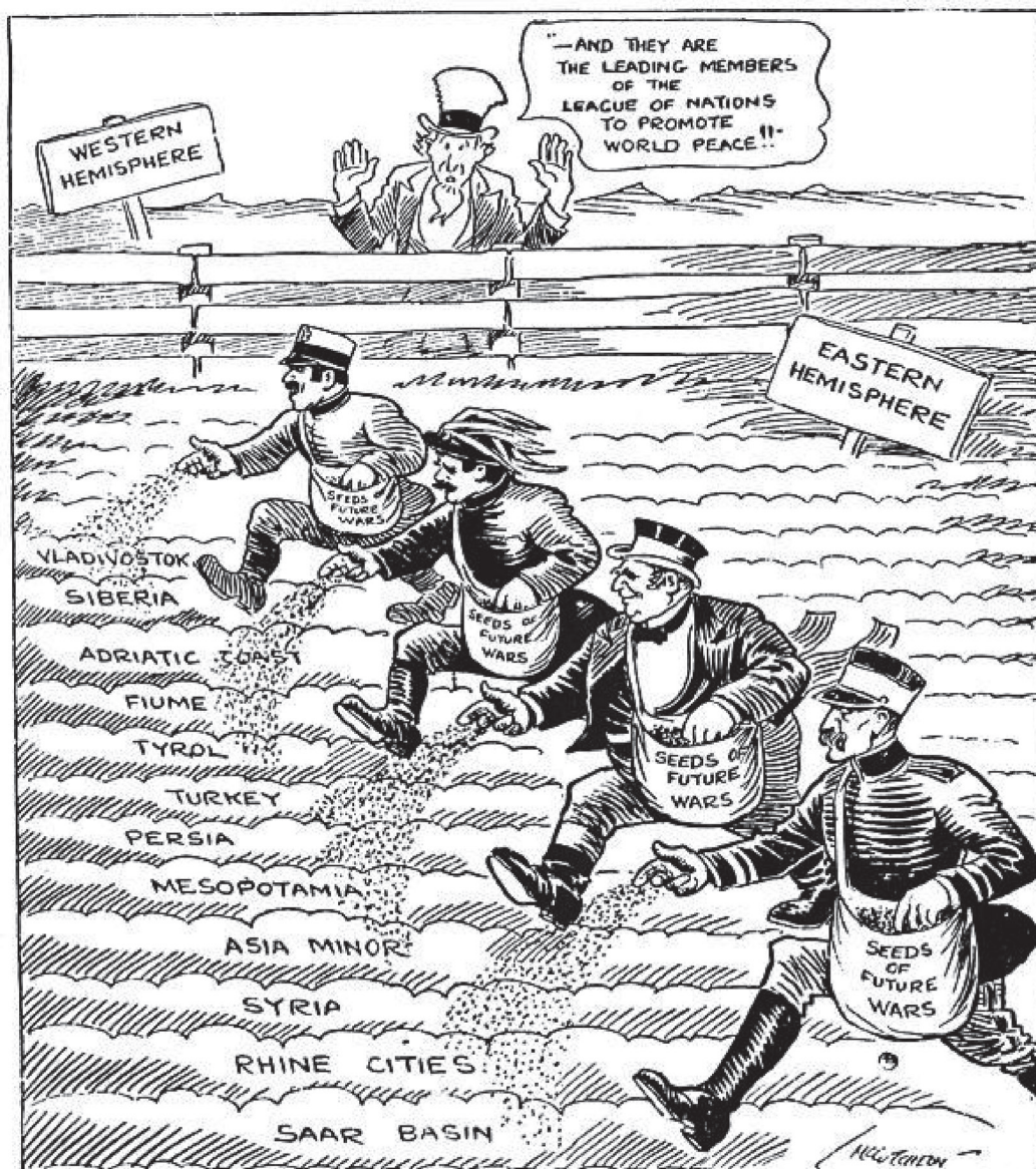
An American cartoon, 1920.