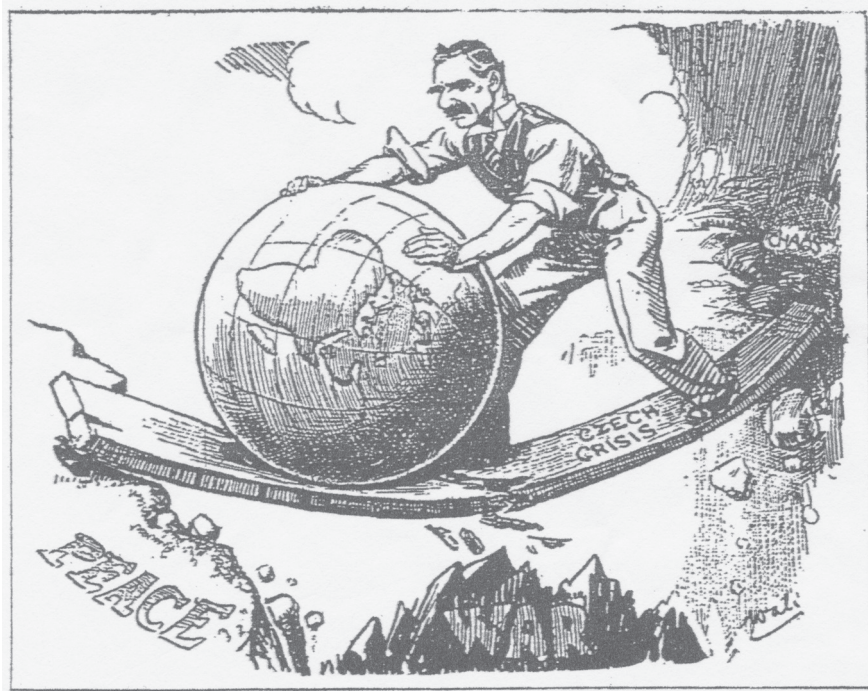
A British cartoon published on 25 September 1938.