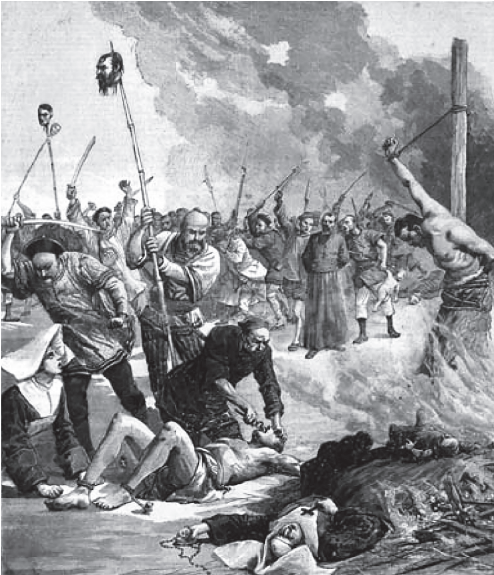
A European drawing from the time showing what happened to some Christians during the Boxer Rebellion.