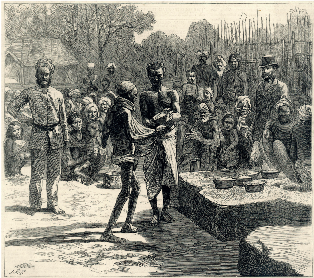
A print of a contemporary engraving showing the distribution of relief