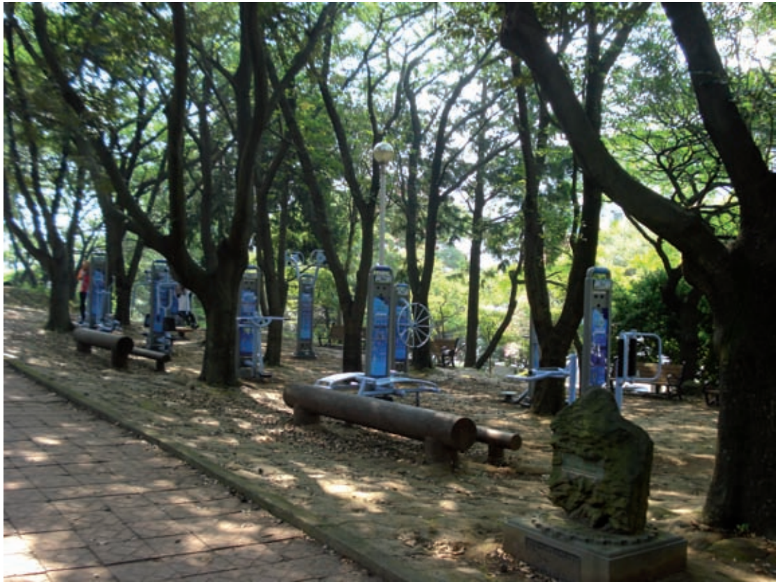
Exercise equipment, Shammu Park, Jeju City