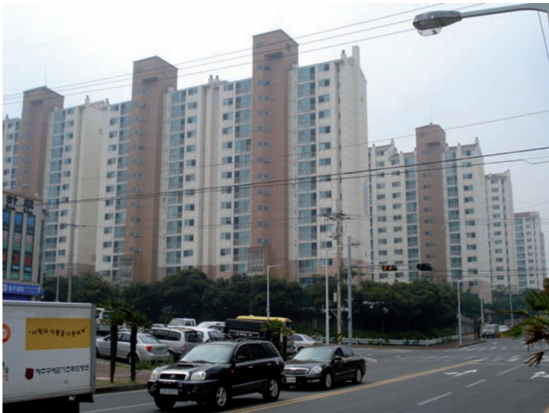
Housing units in Jeju City from the Asian “tiger” period

In Seoul and other South Korean cities attention has been paid to improving the appearance of the streets, while urban parks have been added, some of which celebrate Korean culture. Transport systems have been made more environmentally friendly.