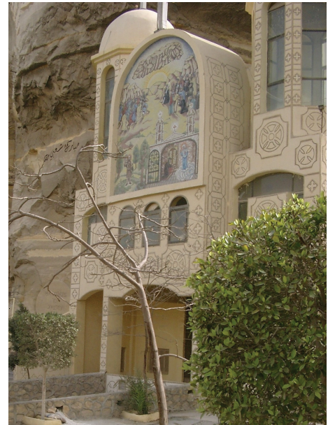
Coptic Church, Cairo

Sporadic sectarian violence between Muslims and Coptic Christians has occurred since President Mubarak was ousted from power in October 2011. One such event resulted in 24 deaths with more than 200 people wounded. These clashes followed the burning of Christian churches. Many blamed an extremist Islamic group, the Salafi, of having orchestrated the violence. The Salafi favour Islamic state rule for Egypt. Copts fear that if this extreme Muslim group gains political power their religious freedom may be restricted even further.