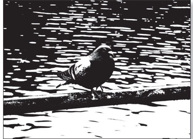
pigeon2.JPG (29 KB)