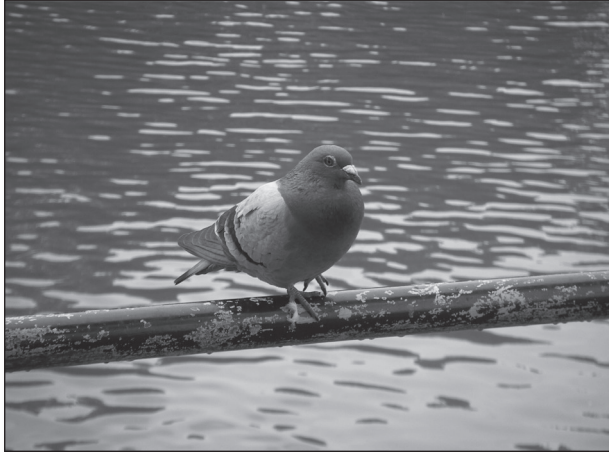
pigeon1.PNG (947 KB)

It is possible to convert digital image files so that they occupy less space. The images below are the same photo saved in different file formats and at different resolutions.