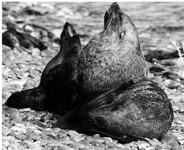
Figure 1(b) Antarctic fur seal