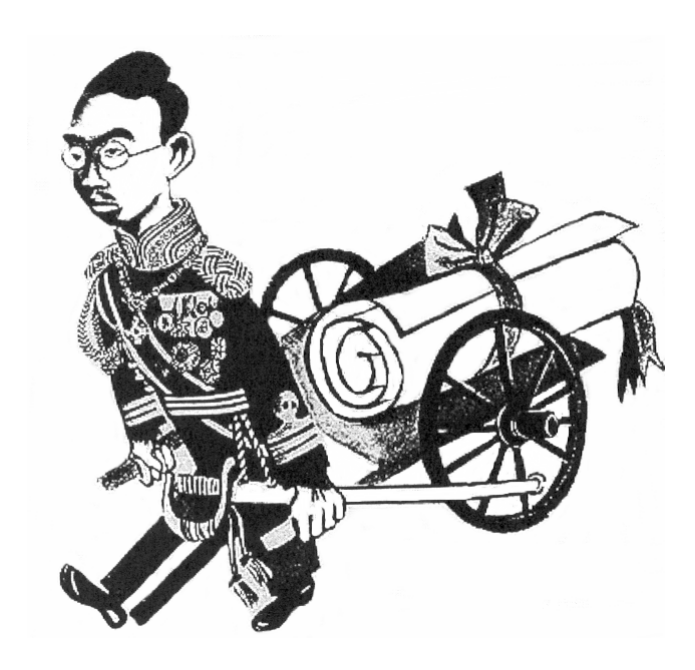
Japan's Emperor gets the Nobel Peace Prize.