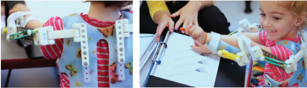
Figure C1: A small child fitted with a lightweight plastic exoskeleton

[Source: Wilmington Robotic Exoskeleton (WREX) developed by researchers at Nemours/ Alfred I. Dupont Hospital for Children. Used with permission.]