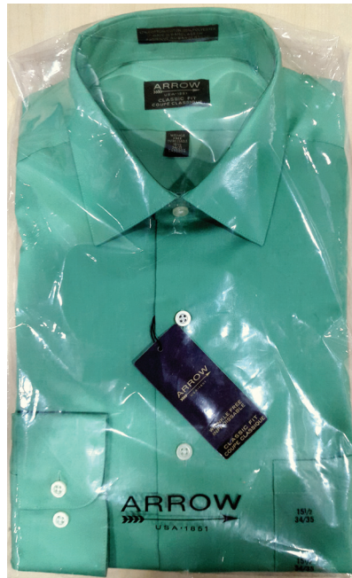
Figure D1: A shirt which can be manufactured from cotton and/or polyester