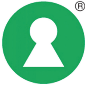
Figure A1: The Nordic Keyhole