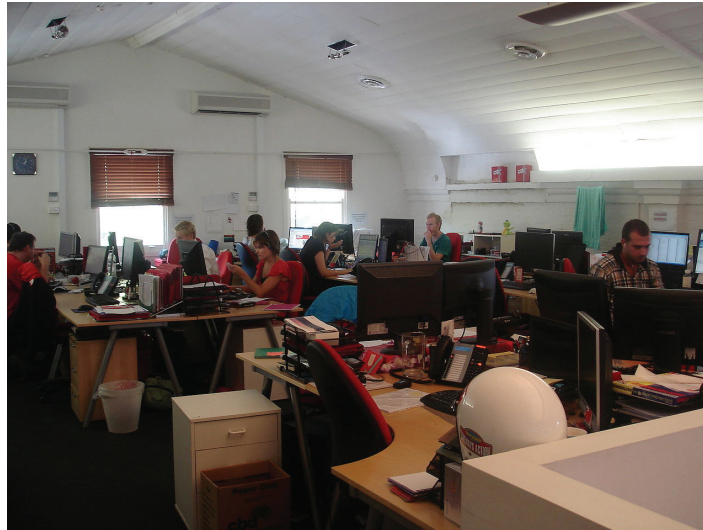
Figure E2: "Bullpen" open-plan office