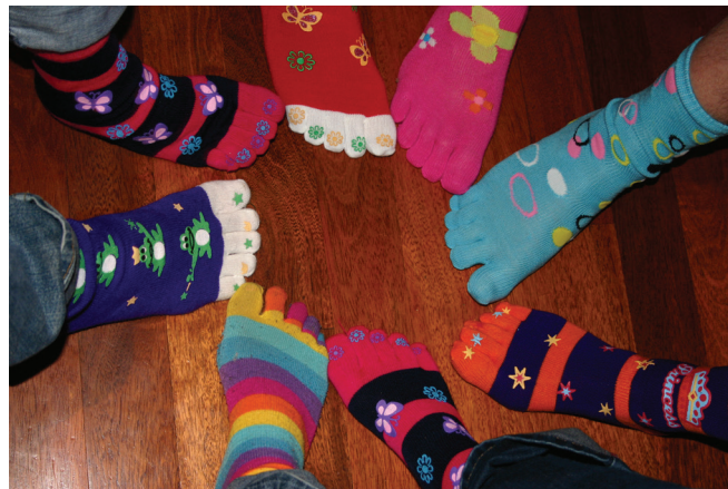
Figure D2: Socks manufactured in wool and nylon