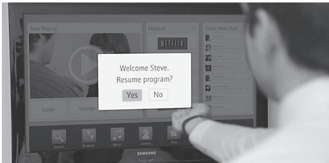
Figure 3: LOKI user authentication

The LOKI also contains sensors that tell a device, such as your cell/mobile phone, how far away you are from it, and lock it if you are not holding it. However, once you are holding the cellphone the LOKI can unlock it without a password. Some LOKI users are considering using it to control all the devices in their smart homes, such as their lighting, heating and other electrical devices.