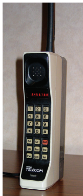
Figure E4: “Candy bar” mobile phone