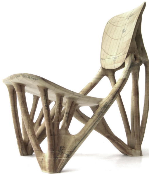
Figure 3: The paper bone chair