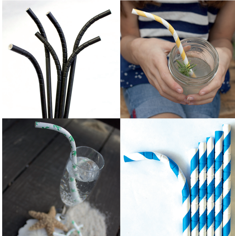
Figure 2: The Eco-Flex straw