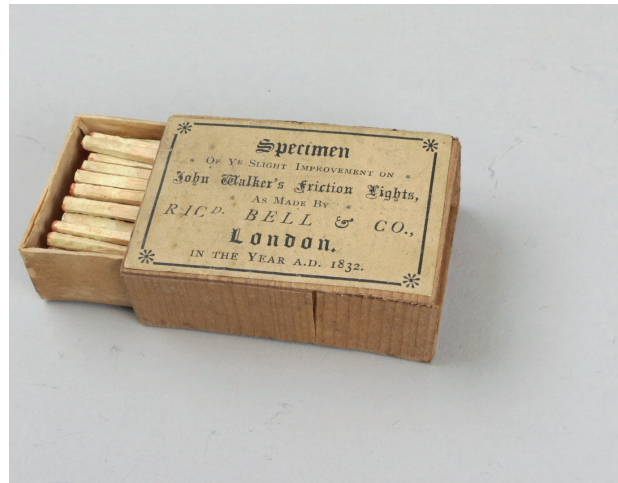
Figure 5: The “Friction Lights” match