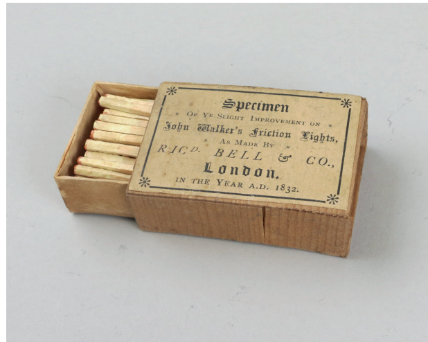
Figure 5: The “Friction Lights” match