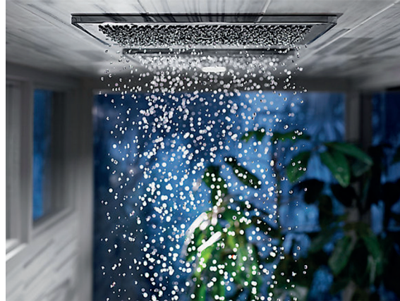
Figure 7: The Kohler Real Rain shower

Studying all the elements of a natural rain shower, from the varying sizes of the raindrops to the angles at which they fall, Kohler has created Real Rain, a showering experience that transports the user beyond the everyday home event. The shower is often a conversation starter.