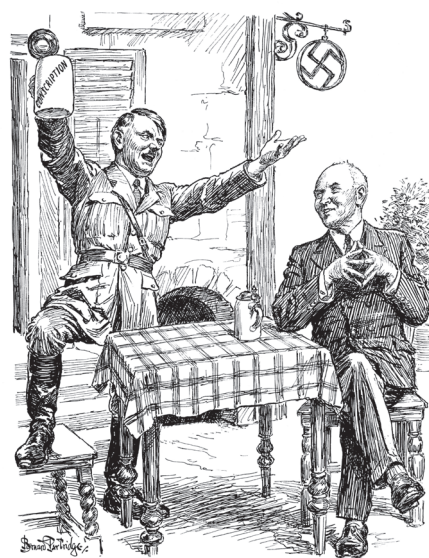
PROSIT! HERR HITLER. "THE MORE WE ARM TOGETHER THE PEACEFULLER WE'LL BE!" SIR JOHN SIMON. "WELL—ER—UP TO A CERTAIN POINT—AND IN CERTAIN CASES— PROVISIONALLY—PERHAPS."

Herr Hitler: “The more we arm together the peacefuller [more peaceful] we’ll be!” Sir John Simon: “Well—er—up to a certain point—and in certain cases—provisionally—perhaps.”