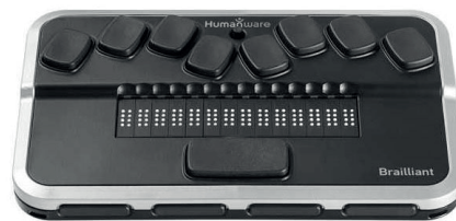
Figure 2: A Braille keyboard