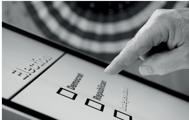
Figure 4: Example of an electronic voting machine (EVM)

The graphical user interface (GUI) of the EVM can be adjusted for different voters. For example, the font size can be increased for voters who have limited vision.