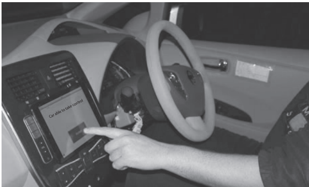
Figure 4: Control panel of a self-driving car