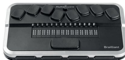
Figure 2: A Braille keyboard