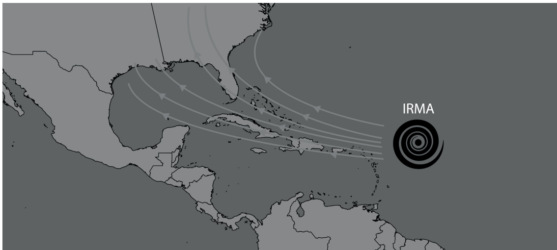
Figure 3: Potential tracks of Hurricane Irma

The European computer model, run by the European Centre for Medium-Range Weather Forecasts, performed far better than the American model, known as the Global Forecast System. However a new model created by the electronics company Panasonic , called PWS, performed best.