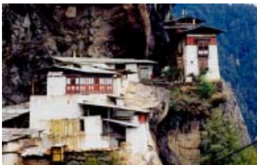
A typical Buddhist monastery in Bhutan