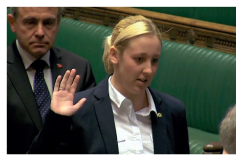
IN THE CHAMBER, 'YOU HEAR FOLK TALKING SO MUCH GUFF. YOU JUST THINK, "YOU'VE NOT GOT A CLUE"