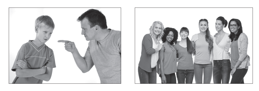
Father and son