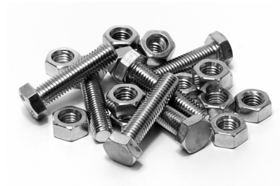
Nuts and bolts