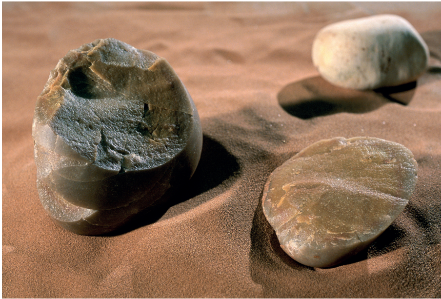
Tools used by Homo habilis