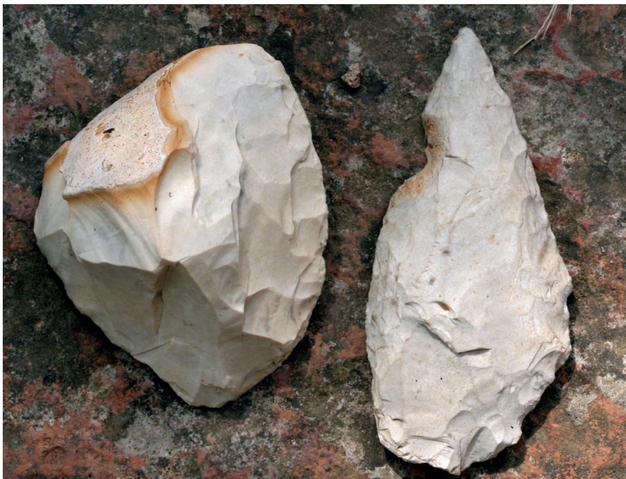
Tools used by Homo neanderthalensis