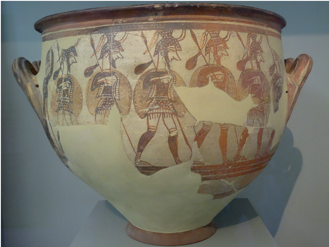
The Warrior Vase from Mycenae