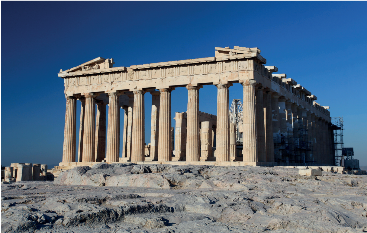
The Parthenon on the Acropolis, Athens