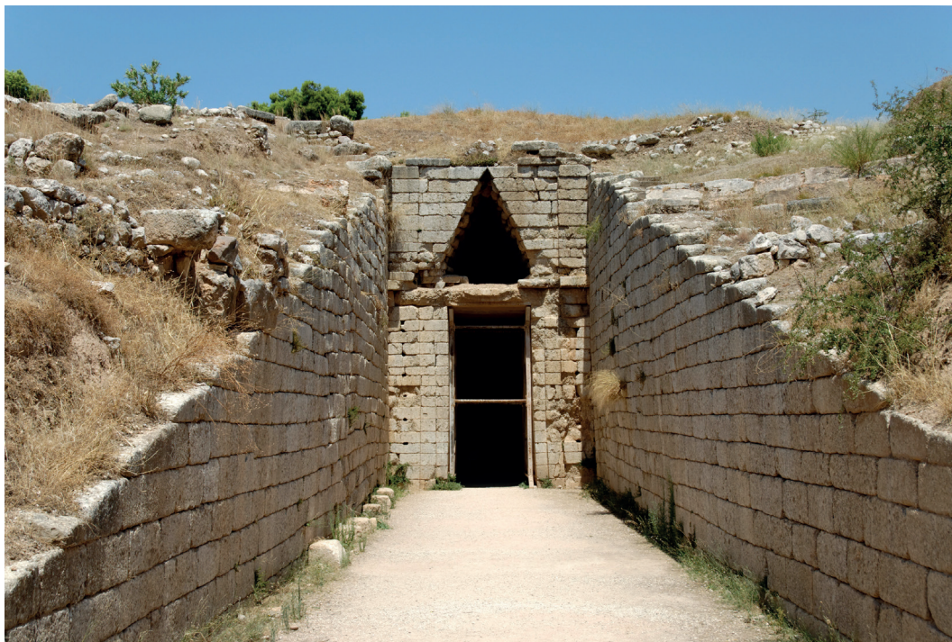
The 'Tomb of Clytemnestra' at Mycenae

1 Study the photograph and answer the questions.