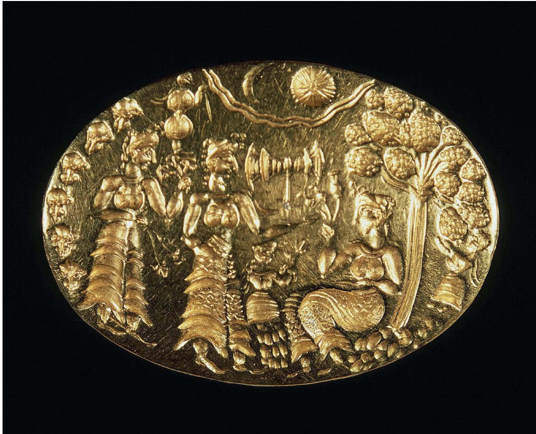
The Great Goddess ring

2 Study the photograph below and answer the questions.