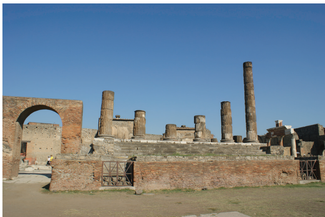
Temple of Jupiter, Pompeii