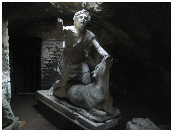
Baths of Mithras, Ostia