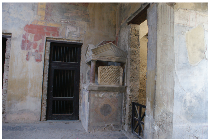
Household shrine, House of Menander, Pompeii

To what extent do you agree that beliefs in religious cults and private religion were more important to the people of Pompeii and Ostia than state religion?