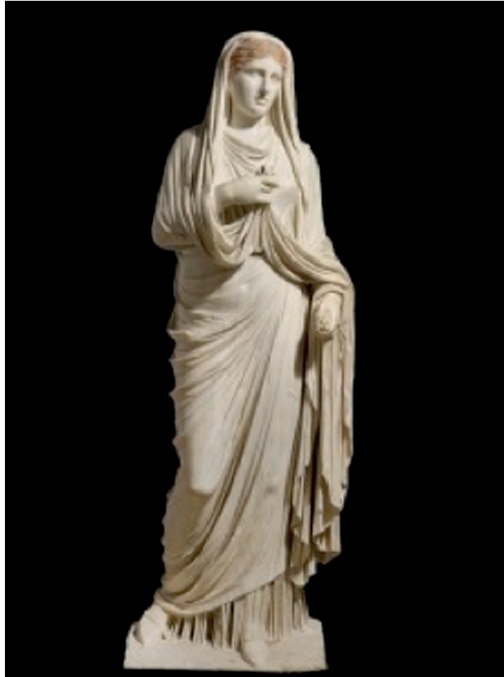
Statue of Eumachia

1 Study the image below and answer the questions.