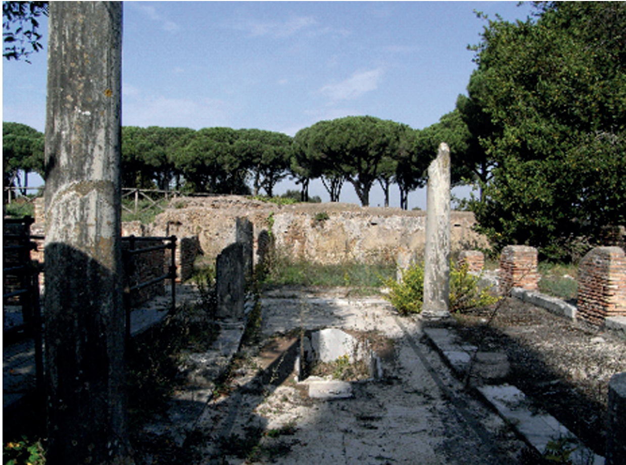
House of Apuleius, Ostia

2 Study the photograph below and answer the questions.