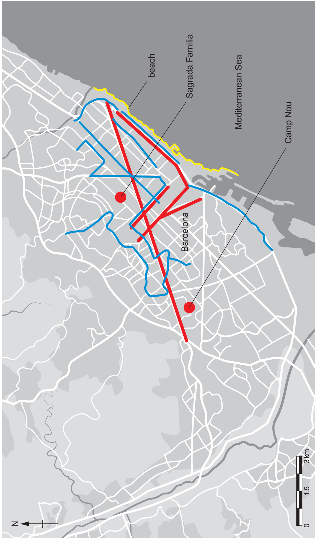
Fig. 5 – Crowd-sourced data of geo-located photographs taken by tourists (in red) and locals (in blue) in Barcelona, Spain

Key: Camp Nou = home of Barcelona Football Club Sagrada Familia = part of a UNESCO World Heritage Site