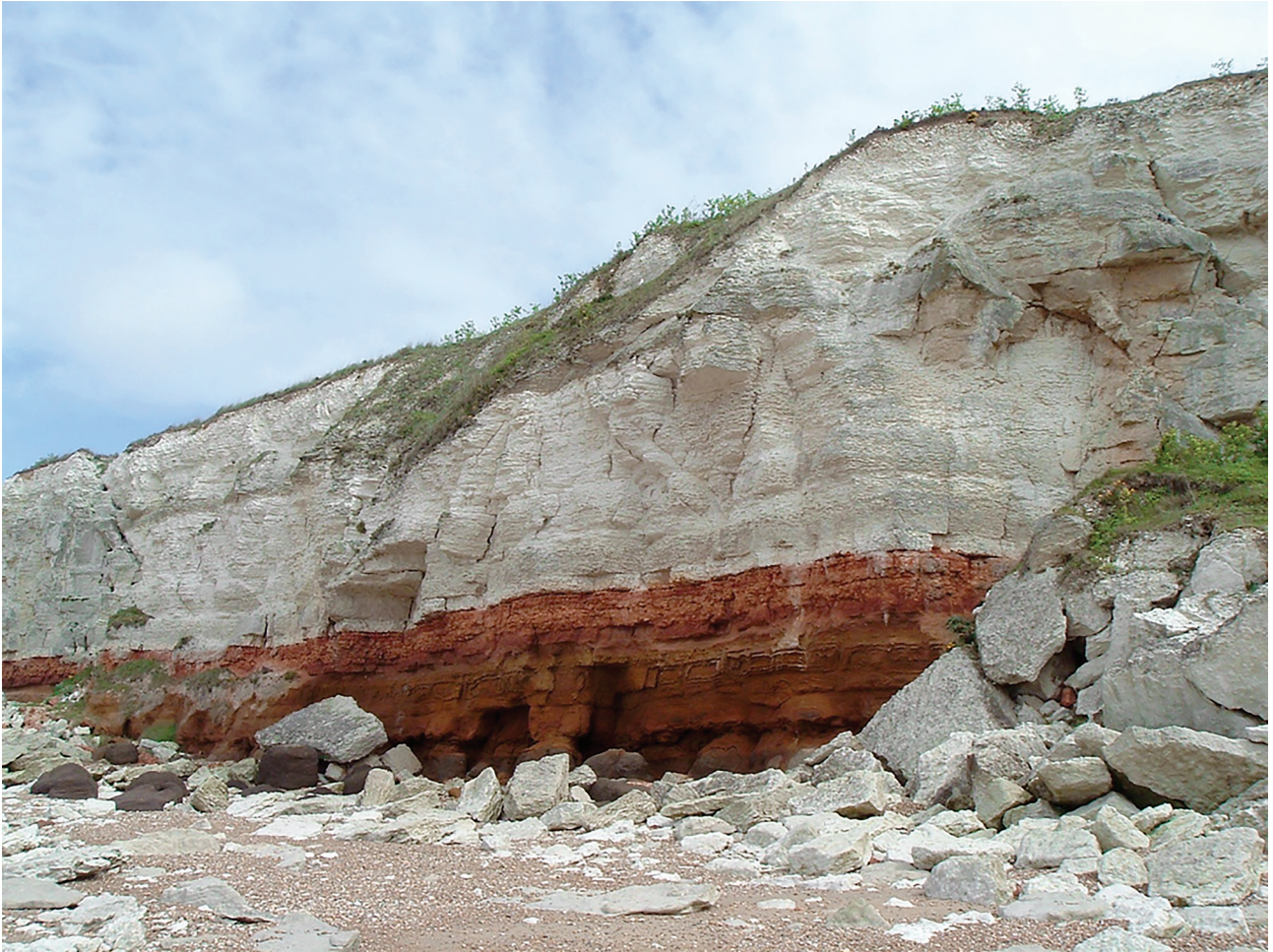
Fig. 1 – A coastal landscape in Norfolk, England