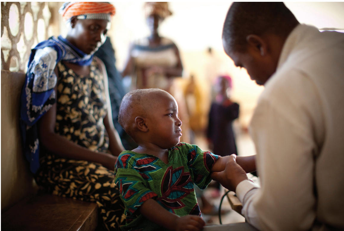
B: Young child receiving a medical exam in Tanzania