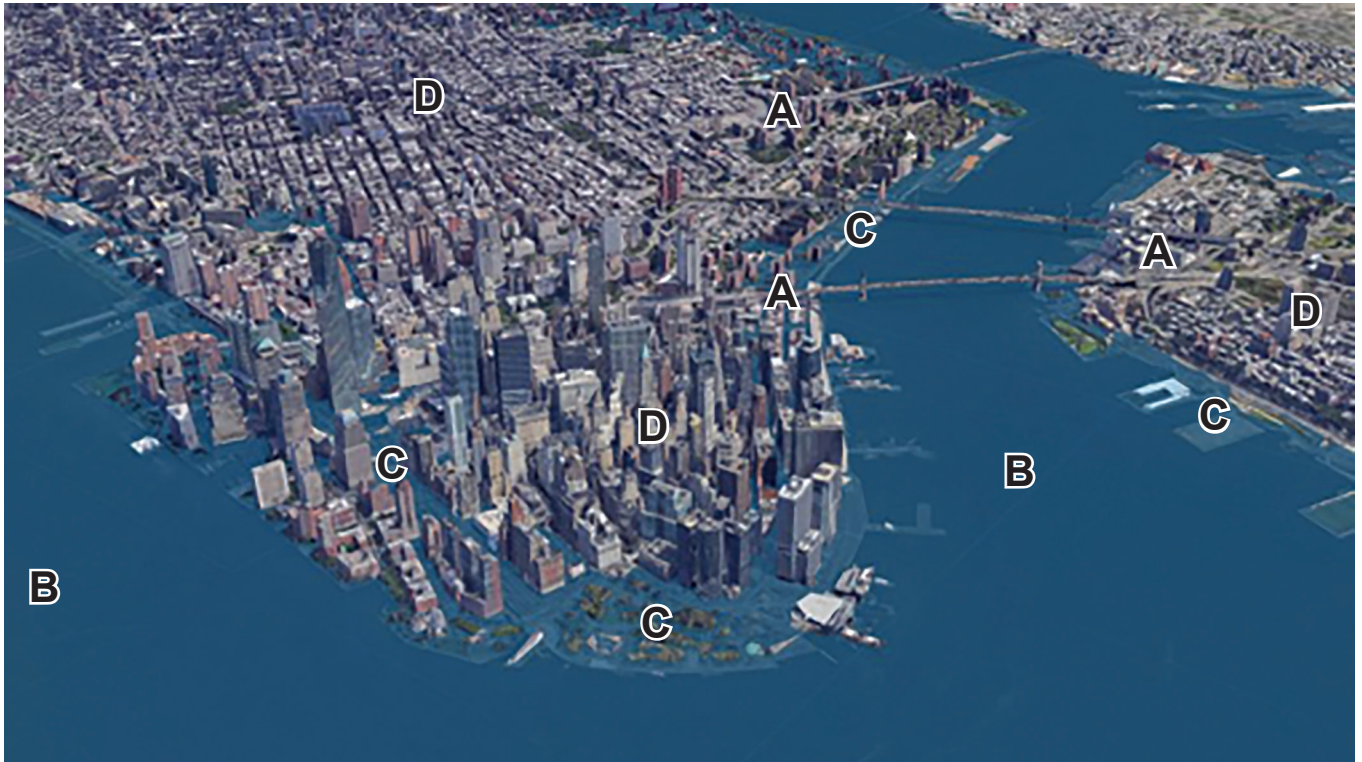
Fig. 6 – The effect of a projected 2.4 metre rise in sea level on part of New York, USA.