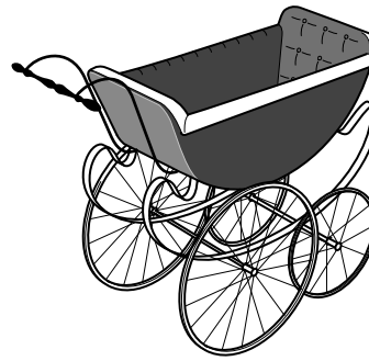
pram from 1900